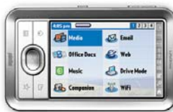
LifeDrive MOBILE MANAGER