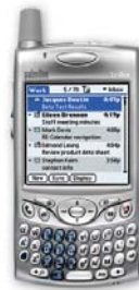
Treo 650 SMARTPHONE