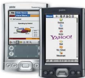
TUNGSTEN E2 HANDHELD